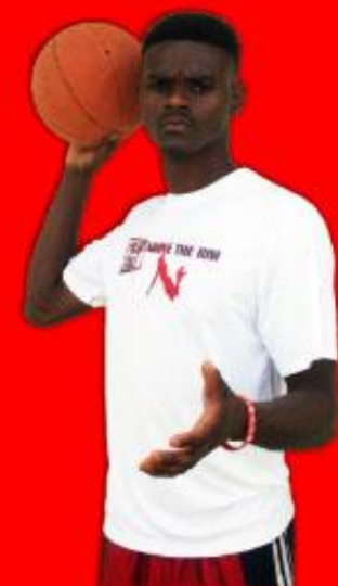
Teaching, Coaching, And Training Basketball For Over 5 Years.