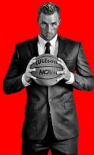
Are You Ready? Find out what the Pros know.